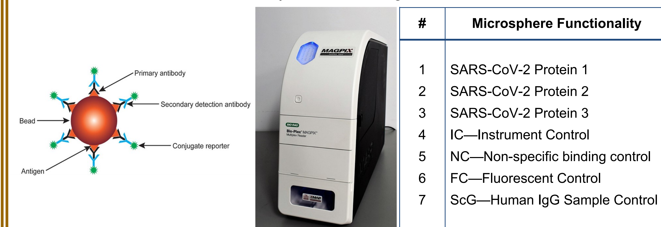
Figure 1. FlexImmArray SARS-Cov-2 Human IgG antibody test depiction and the MAGPIX® instrument used for multiplex assay reading

As stated in Section IV.D of the FDA's Policy for Coronavirus Disease-2019 Tests , the FDA does not intend to object to a commercial manufacturer's development and distribution of serology tests to identify antibodies to SARS-CoV-2 for a reasonable period of time, where the test has been validated and while the manufacturer is preparing its EUA request, where the manufacturer gives notification to the FDA and information that helps users and patients understand the test results, and clearly indicates the limitations of the tests in the instructions for use. These tests are to be used in qualified and certified laboratories capable of performing high-complexity laboratory testing. Simple depiction of the multiplex serology test, an indirect immunoassay where the specific IgG antibody in the human sample bound to the microsphere-coupled antigen measured using a secondary fluorescent labeled detection antibody, is shown in Figure 1.